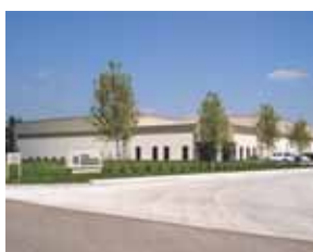
Kansas City, KS