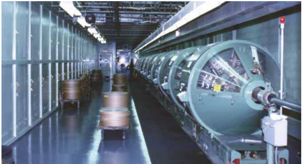
One of two EHV voltage taping head machines.

Pipe Type Cables have an outstanding and a proven track record of over 80 years. Modern extra-high voltage solid dielectric cables have only limited service years and rely upon statistical analysis of accelerated testing to attempt to attain a 40 year plus life cycle.