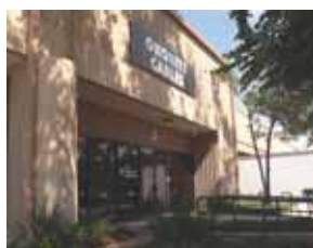
New Orleans, LA