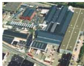
Paterson, NJ - Manufacturing Plant