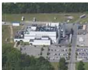
Orangeburg, SC - Compound Facility