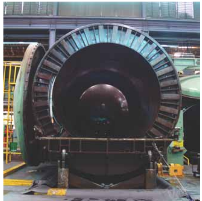
Horizontal Tank capable of impregnating up to 345 kv HPFF cables in lengths of 6,500 to 12,000 feet on 188" diameter reel.