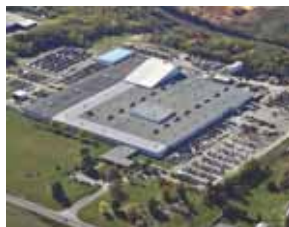
Richmond, KY - Manufacturing Plant