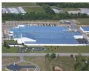
Orangeburg, SC - Manufacturing Plant