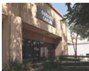
New Orleans, LA