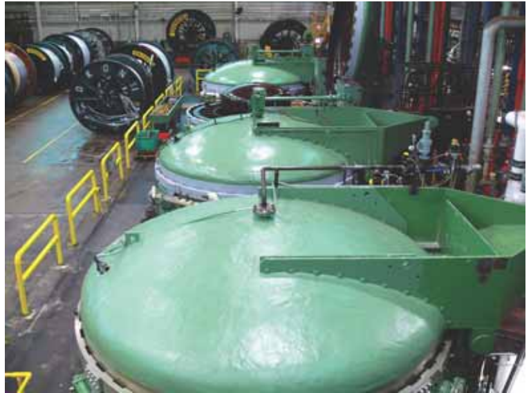
Four Vertical tanks for impregnating up to 345 kv HPFF cables in Lengths of 8,000 to 10,000 feet on 174" diameter reels.

Let Okonite help you design and manufacture the most reliable UG Transmission system with Pipe Type Cables having over an 82 year incomparable and highly reliable service record.