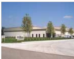
Kansas City, KS