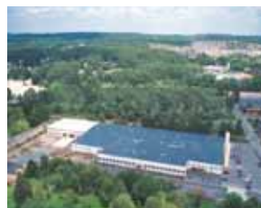
Ashton, RI - Manufacturing Plant