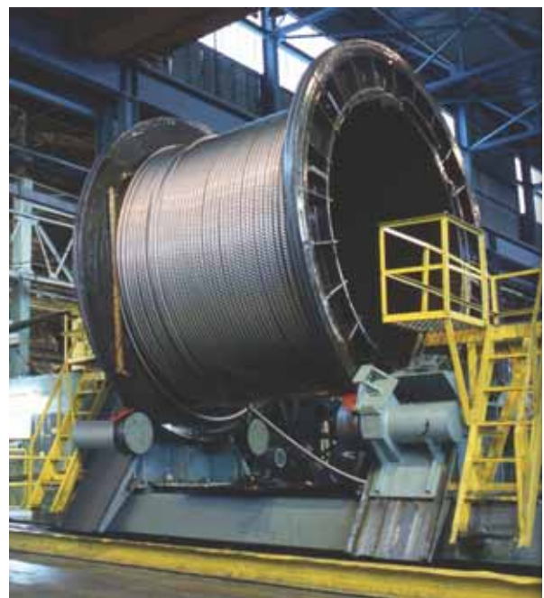
On right reel - Large 188" reel in the paper taping machine.