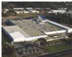
Santa Maria, CA - Manufacturing Plant